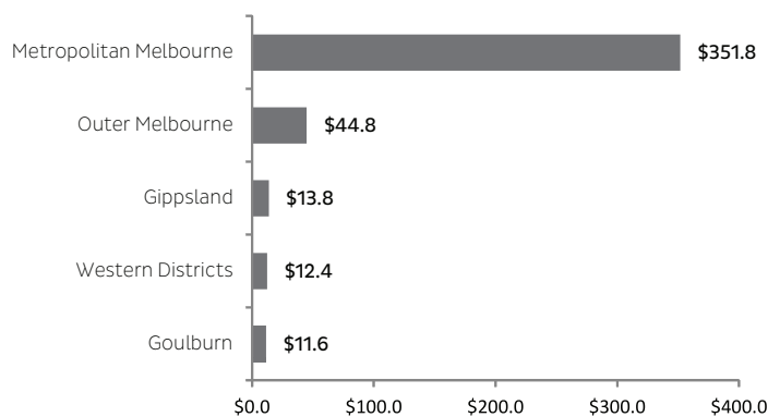
TOP 5 REGIONS FOR CUSTOMER EXPENDITURE

THOROUGHBRED RACING'S CUSTOMERS GENERATE SPENDING OF MORE THAN $483 MILLION IN VICTORIA. SPENDING ASSOCIATED WITH METROPOLITAN RACING CLUBS ACCOUNTS FOR 72% OF THIS TOTAL