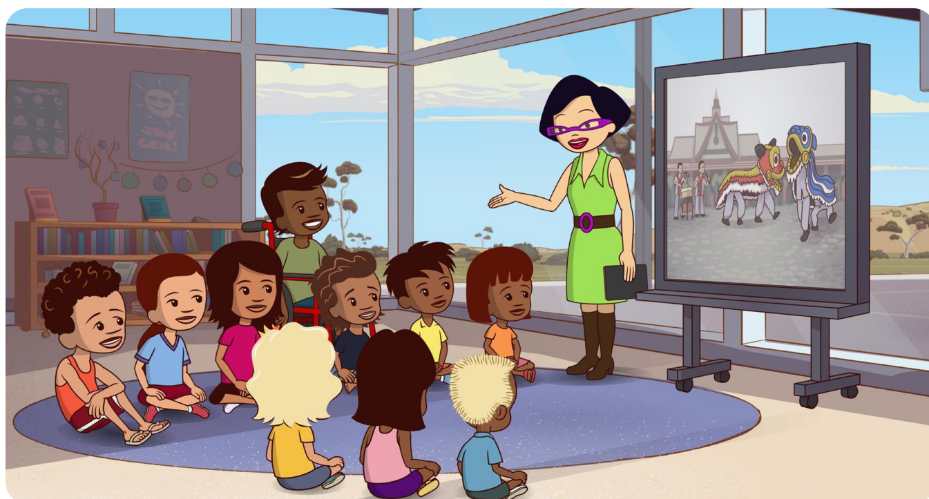
Little J & Big Cuz