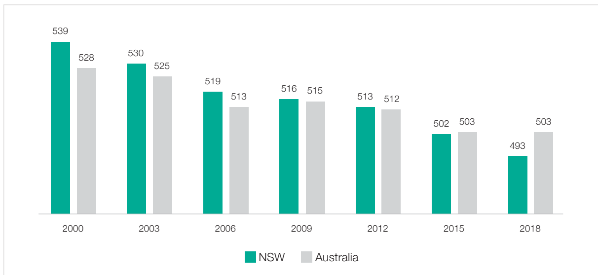
Figure 2. The PISA reading mean scores, NSW and Australia, 2000–2018, Australian Council for Educational Research 8

The OECD's Programme for International Student Assessment (PISA) – which measures 15-year-olds' ability to use their reading, mathematics and science knowledge and skills to meet real-life challenges – also shows dire declines in the reading skills of NSW students over the last two decades. The PISA reading mean score dropped 46 points in NSW between 2000 and 2018. 6 Since 2015, NSW has also fallen below the national reading average for Australia. 7