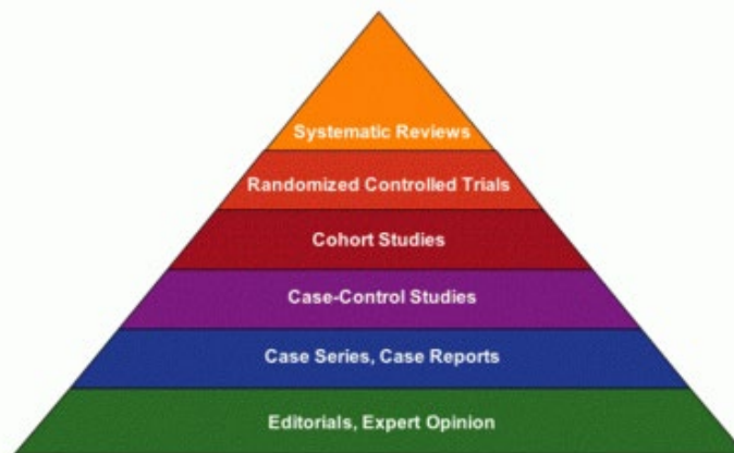
Evidence Hierarchy – Places children's voices at the bottom