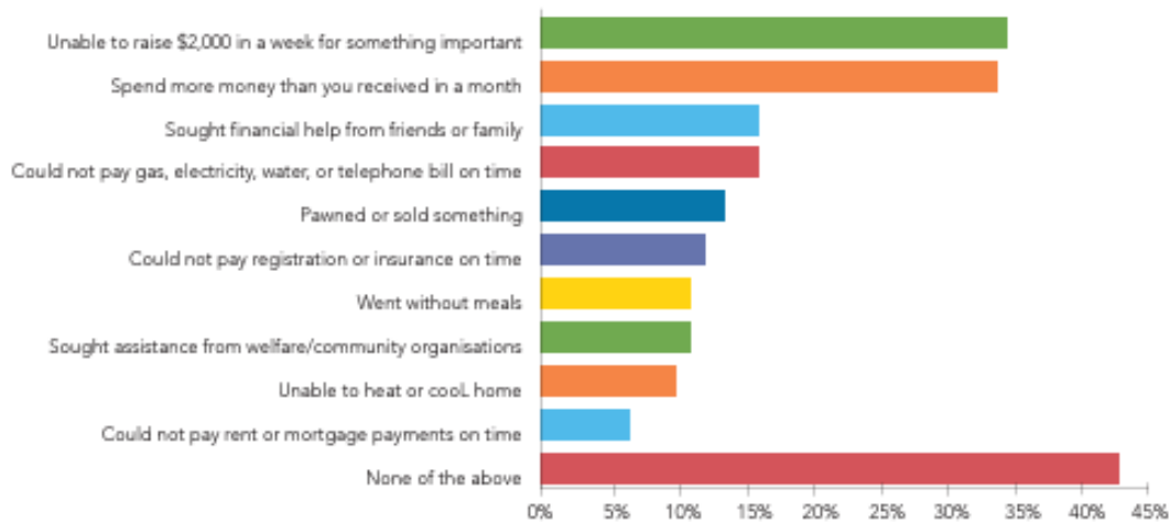
Figure 2 Carer experiences of financial stress (Carers NSW, 2023)

Even for a carer who is able to work full-time, the cost of respite can be exhaustive – as demonstrated in the case study below.