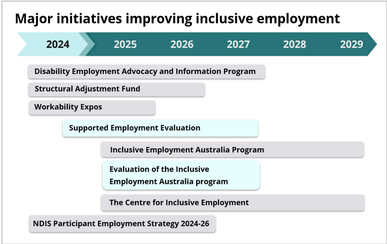
Figure. 2. Timeframe of major initiatives

The key existing initiatives which are looking to improve inclusive employment for people with disability are highlighted in Figure 2.